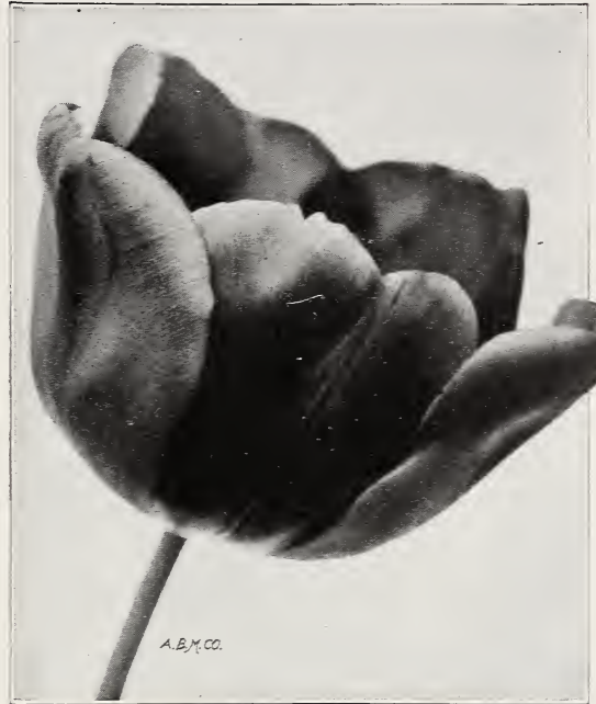
Prince of Austria.

Plant from September to December in rich, light, sandy soil in four or five-inch pots. Place the bulbs so that the tops will be just below the surface, care being taken not to pack the soil, as bulbs will be less likely to push out when root growth commences if the soil is fine and loose. Water thoroughly and set in a cool, dark place for several weeks to allow of sufficient root growth, this being one of the essentials if large flowers and long stems are desired. They should be watered occasionally if soil appears to be drying out. A succession of bloom may be had by bringing the pots into the light at different times. During their growth they should be kept near the light at a temperature of 50 to 70 degrees and watered frequently. Two bulbs in a four-inch pot have been found desirable. A splendid effect is obtained by planting from four to a dozen bulbs in a medium-sized pot. When they show a tendency to bloom just above the bulbs, they must be kept longer in the dark to draw out the flower stems. Most varieties do well when grown indoors.